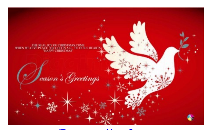
From all of us